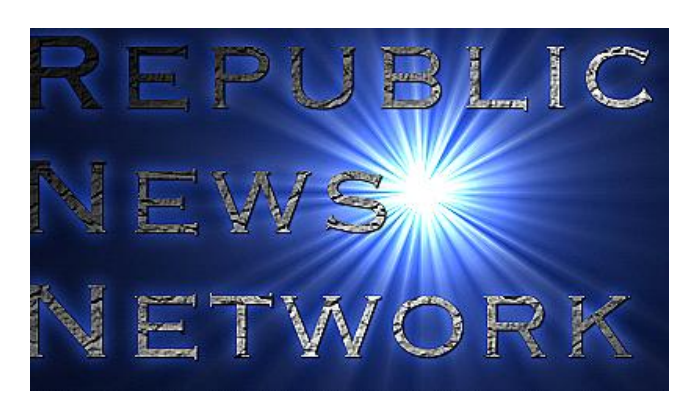
Simulcasting at: The American Republic blogtalkradio

Visit us at: Republicfortheunitedstates.org